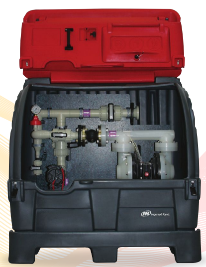
ARO Station - Cover Open